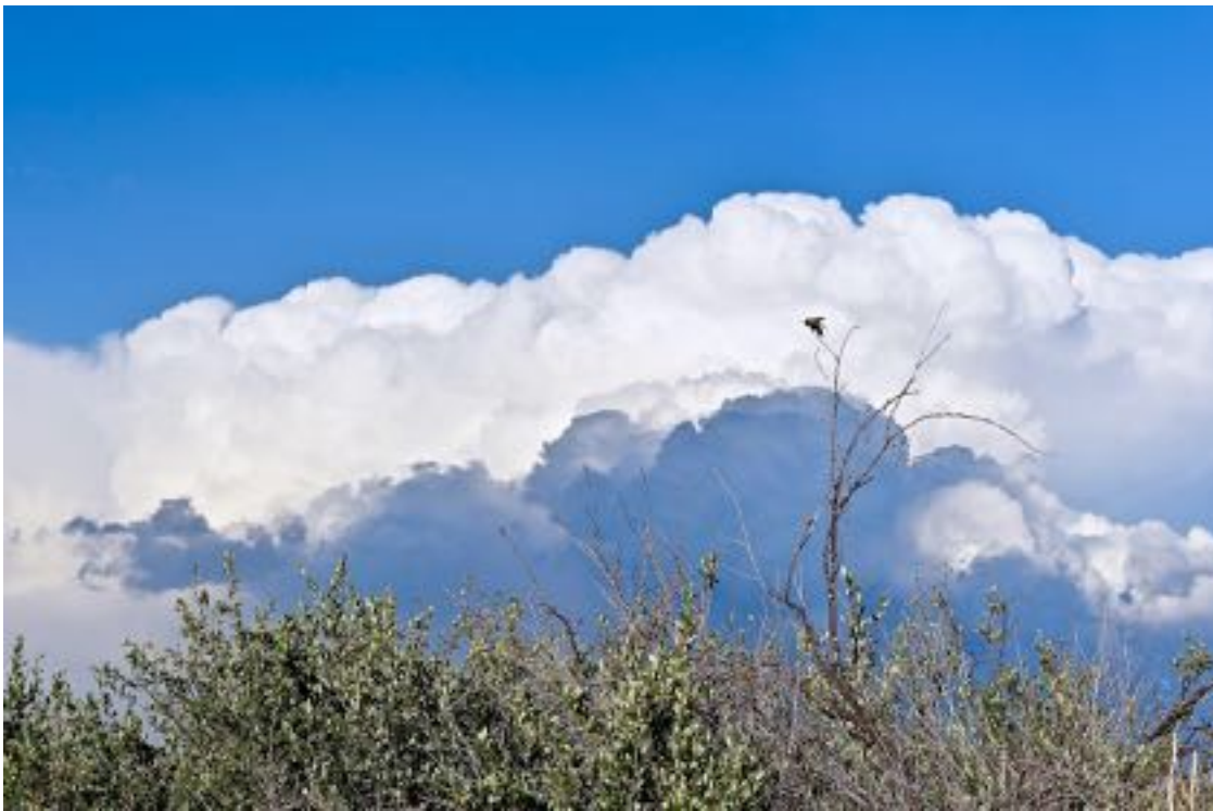
Windy Day: Perched Hummingbird in Front of a Thunderhead