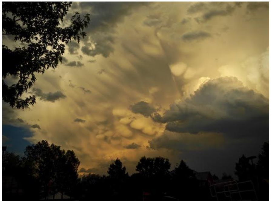
Mammatus clouds near the Chapparal Pool, June 19 2016